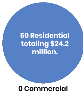
MORTGAGE DEALS FUNDED (IN VALUE) for three months ended September 30, 2022